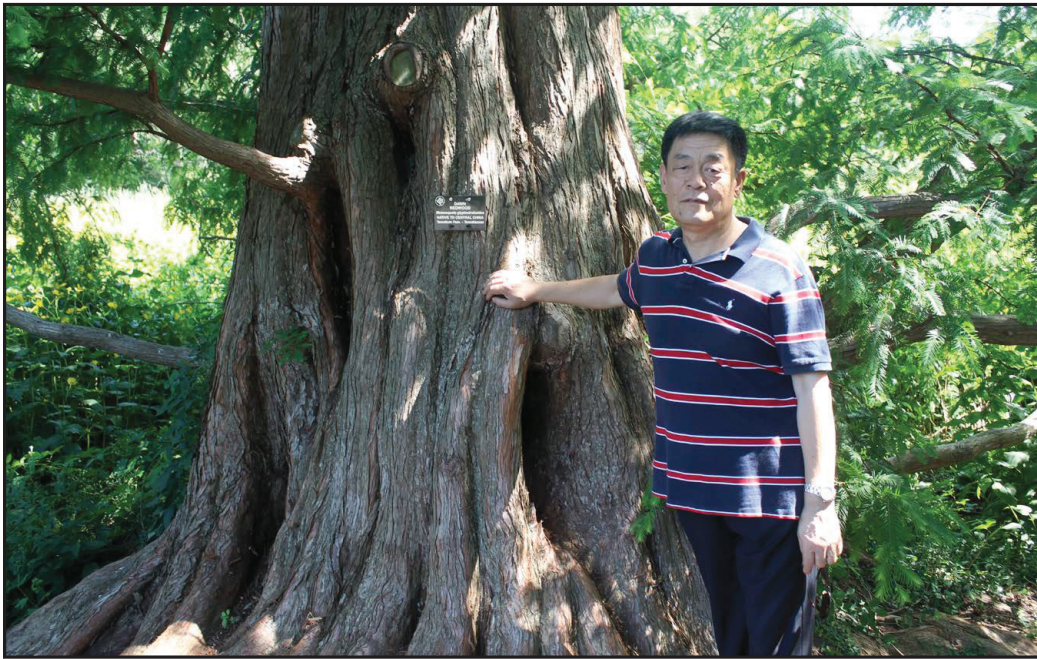
Dawn Redwood, Arnold Arboretum, Boston